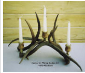
Enlarge 3C930 Details