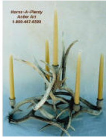
Enlarge 5C934 Details