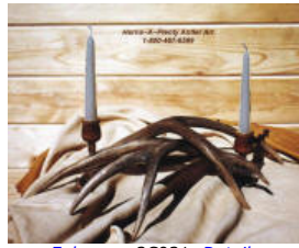
Enlarge 2C931 Details