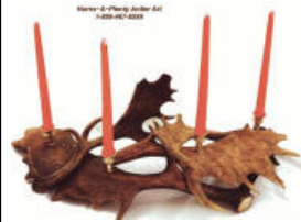
Enlarge FD935 Details

These graceful natural antler candelabras are the perfect accents for your dining tables, end tables, mantles, or window sills. Incorporate them into a seasonal wreath or centerpiece. They look beautiful with fall leaves for the Thanksgiving season, green pine boughs and pinecones at Christmas, bright flowers in the spring, and sunflowers in the summer. Achieve different effects with various sizes, shapes and colors of candles. Available with Grade 1 , Grade 2 or Grade 3 antlers. The size and shape of each piece will vary depending on the antlers used. Candle cups are brass and they are attached to the antlers with an adjustable brass swivel. Antler or wooden candle cups are no longer available. 100% satisfaction guarantee. Click here for more details on ordering . Shipping price is for 1 item anywhere in the continental US. Combined item shipping available.