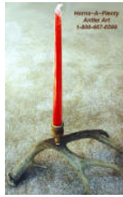
Enlarge 1C932 Details