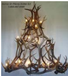
Enlarge EK389-NS Details