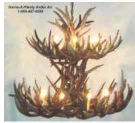
Enlarge DT321-NS Details