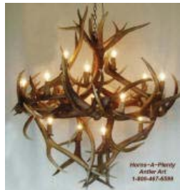
Enlarge EK394-NS Details