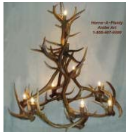
Enlarge EK393-NS Details