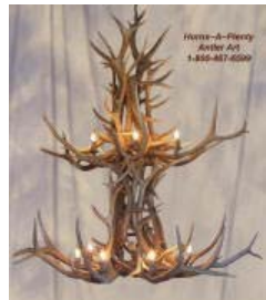
Enlarge EK326-NS Details