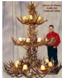
Enlarge 3T385-R Details