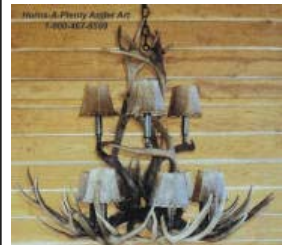
Enlarge CC391-R Details