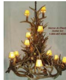
Enlarge EW392-R Details