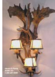
Enlarge WE265 Details