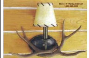
Enlarge WE250-W Details