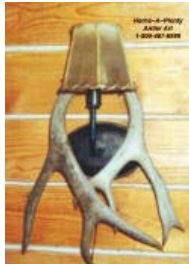
Enlarge WE225 Details