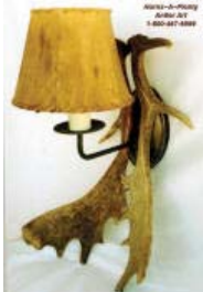
Enlarge WE260 Details