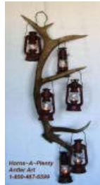
Enlarge WC270 Details