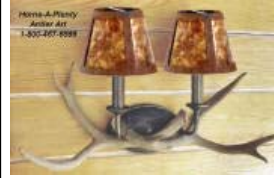
Enlarge WE251-M Details