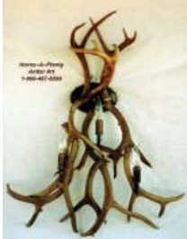
Enlarge WE211 Details