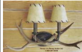
Enlarge WE251-W Details

Antler wall sconces are a great way to add extra lighting and a beautiful natural touch to a room without using valuable floor space. We also make custom designs! All direct-wired sconces are UL-Approved. Standard light socket covers and mounting plates are gunmetal black, but may also be glossy black, flat black, painted rust, flat dark brown, oil-rubbed bronze (paint), or old-fashioned rust ( click here for finish photos). Antler light socket covers are not available for wall sconces. Standard wiring on wall sconces is for direct wiring into junction box on your wall, but we can also wire them with a cord and plug for plugging into electrical outlet. Mica, rawhide or western-style shades are available for this style (please order with sconce). Standard models are Grade 2 antlers with light to medium brown stain. The size and shape of each piece will vary depending on the antlers used. Shipping price is for 1 item anywhere in the continental US. Combined item shipping available.