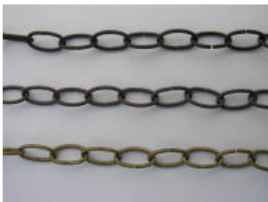
8 ga. Black, Rust, Antique Brass

We offer three standard chain finishes. They are black, rust, or antique brass. We can also match paint colors if you provide a color number. Please specify which finish you prefer when ordering. Click on any photo to enlarge.