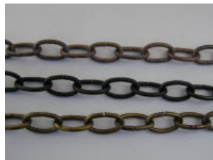
4 ga. Rust, Black, Antique Brass